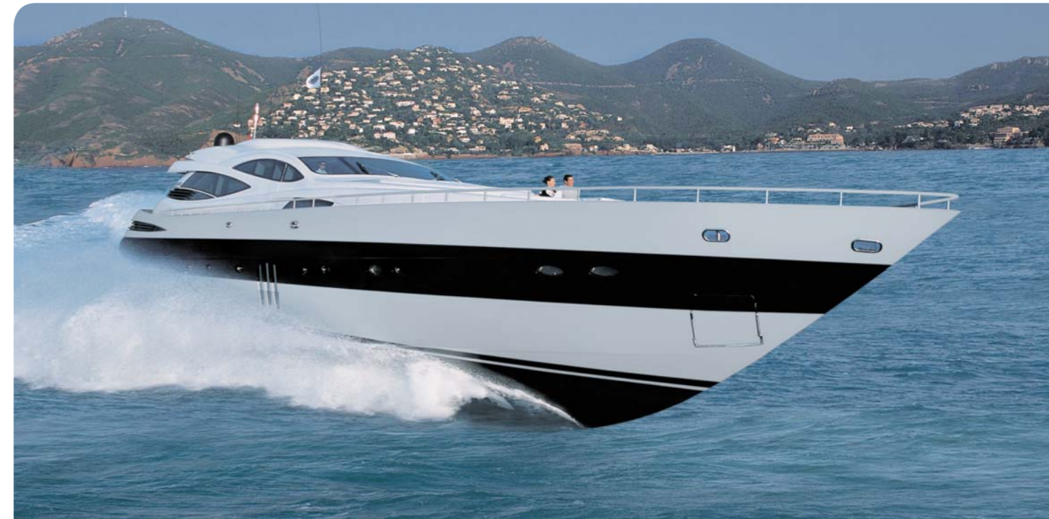
The sleek, elegant Pershing 115 is the first high-performance yacht to have the new ITCP panel installed in its machinery room.

The first test came in February 2007 when a prototype ITCP was connected to a TF50 for actual engine start and operations validation. The TF50 functioned perfectly, never realizing it had a new rider in the saddle. The ITCP was then shipped to La Spezia to begin the crucial activity of programming and validating all of the other system functions. Once all programming was complete, the ITCP prototype with the engine, gearbox, bridge control and local control panel were