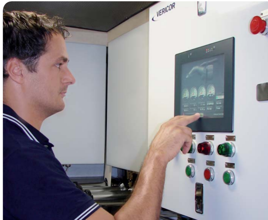
The important data at a single glance, deeper information with just a few touches of the screen.

For the integrated control system to be a success, it was critical that Vericor, as the