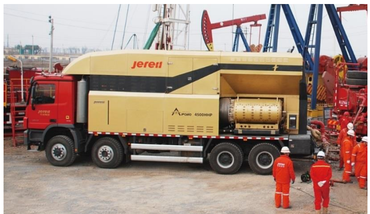
The 4500 shp Apollo1 Hydraulic Fracturing Trailer in Field Tests