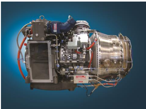
Vericor's TF50F Gas Turbine

The modular nature of these engines allows for easy inspections on site. This ease of care approach simplifies stocking of spares and lowers downtime and maintenance periods. Recommended maintenance cycles are 30,000 hours for a hot section overhaul and 60,000 hours for a major overhaul.