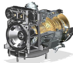
Vericor's TF50F Gas Turbine