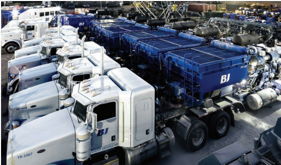
BJ fleet 'Powered by Vericor' ©